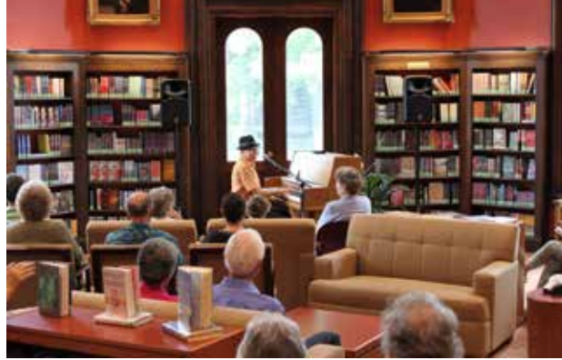
Programs such as this are supported by the Friends.