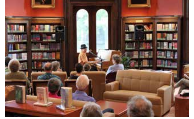
Programs such as this are supported by the Friends.